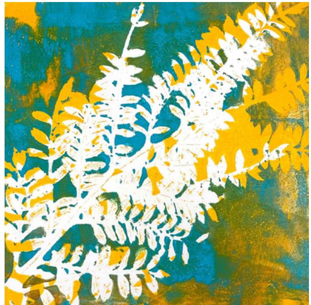
Gelatin Plate Monoprinting, PRIVATE GROUP March 2021

https://kimherringe.com.au/print-gallery-2/monotype-workshop-gallery/