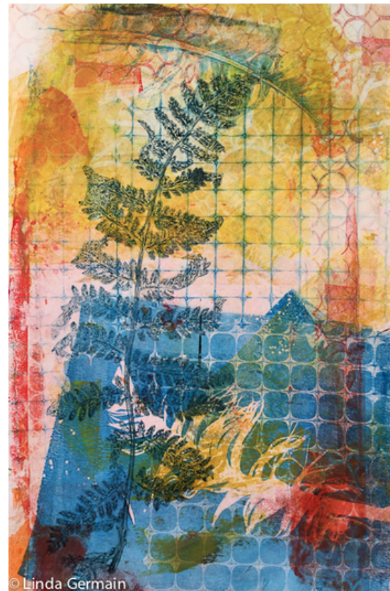
Multi colored Gelatin Print May 2017

“Gelatin printmaking is fast and gives you immediate feedback about composition and design skills. That is one reason that I love the process.”